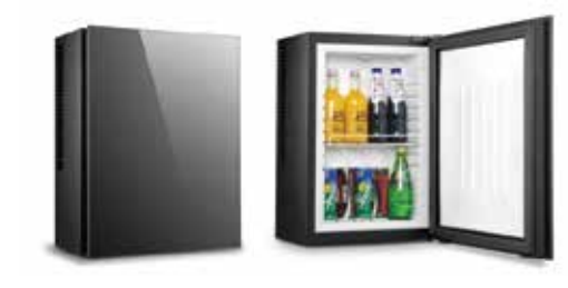
Salvini Mini Bar #SAL - BCH - 12B